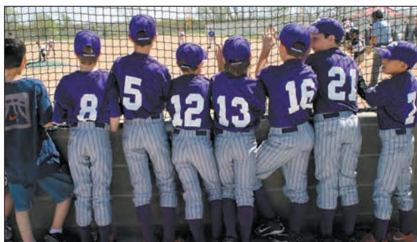
Youngsters watch action at YMCA Rotary Park.