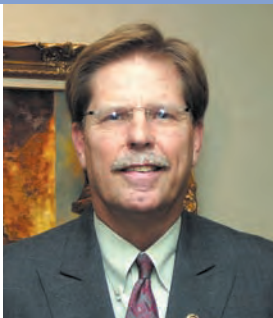
Richard L. Hanna